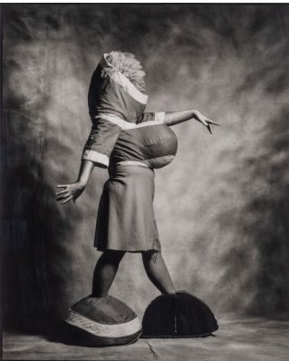
Fergus Greer, ohne Titel (Leigh Bowery im Kostüm) , o.J.

Cocktail Prolongé. F.C. Gundlach Special | June 5 – September 22, 2026