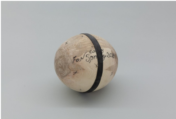
Nina Porter, for early spring 2029 , 2025 Wood, rubber, metal, cotton, pencil, paint. Box: calico, paint, ribbon, foam, board. 21 x 17 x 19 cm

Nina Porter: Sample Question | June 5 – September 22, 2026