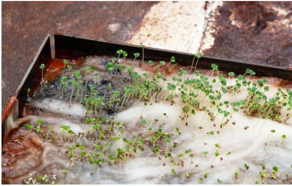
Studio photo, 2025 © Melike Kara

Melike Kara. Whispers | June 5 – August 23, 2026