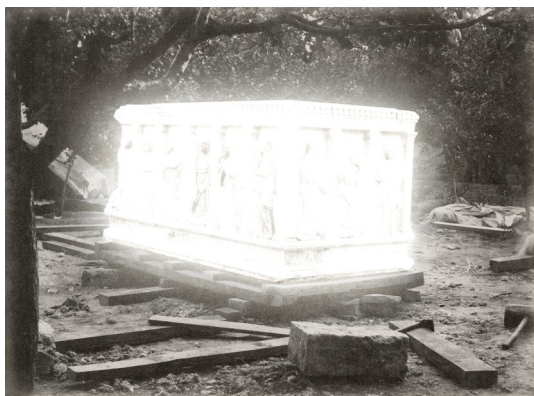
Akram Zaatari, From the series: An Extraordinary Event , 2018. Inkjet print, in 8 parts, 44,6 x 35,7 x 3,5 cm. Photographs based on the AbdulHamid album #91533.

BUT I WORLD I SEE YOU* | June 5 – October 4, 2026 | (*Rémy Zaugg)