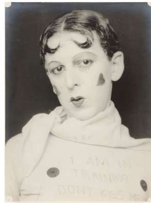
Claude Cahun, Untitled , 1927 Black-and-white photography