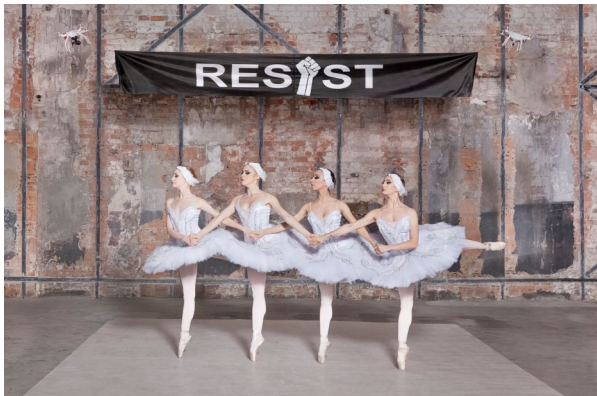
Halil Altindere, Ballerinas and Police , 2017 (Still) Collection FRAC des Pays de la Loire © Halil Altindere

Inner Mornings, Or Forms of Counterculture | June 5 – September 13, 2026