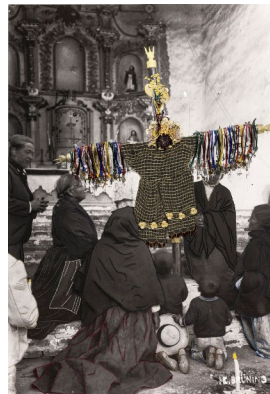
Marystela Camacho, Embroidery on the photograph The Crucifixion at Motupe (1907) by H. H. Brüning , 2026. Watercolor, beads, rhinestones, dried wildflowers, polyester thread, and decorative cords on Hahnemühle Photo Rag paper. MARKK Inv No 2026.14:1