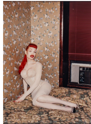
Katharina Bosse, Untitled , 1999 © Katharina Bosse