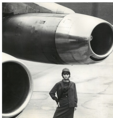
F.C. Gundlach, „ Jet Age “, Hamburg 1963 © F.C. Gundlach, Courtesy Stiftung F.C. Gundlach