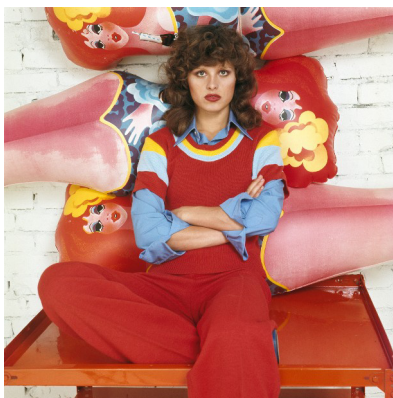
F.C. Gundlach, Uschi Obermaier, Hamburg 1970

F. C. Gundlach. You'll Never Watch Alone | May 8 – August 16, 2026