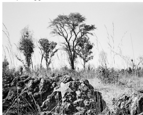
Jo Ractliffe, Unmarked set of graves on the outskirts of Cuito Cuanavale (From the series: As Terras do Fim do Mundo ), 2009. Individual printed platinum print, 37 x 44,4 cm © Jo Ractliffe