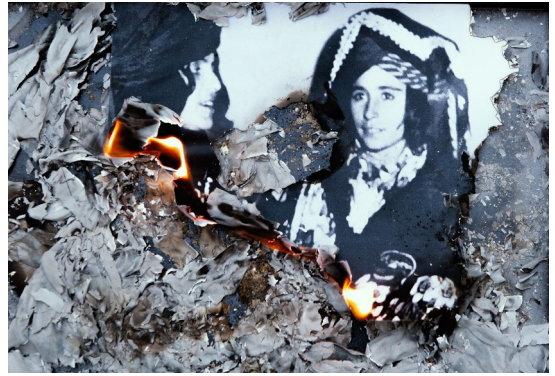
Studio photo, 2025 © Melike Kara