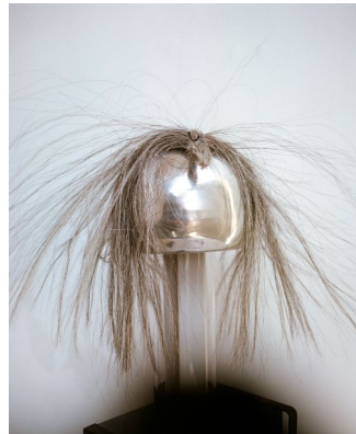
Nina Porter, Sample Question , 2026